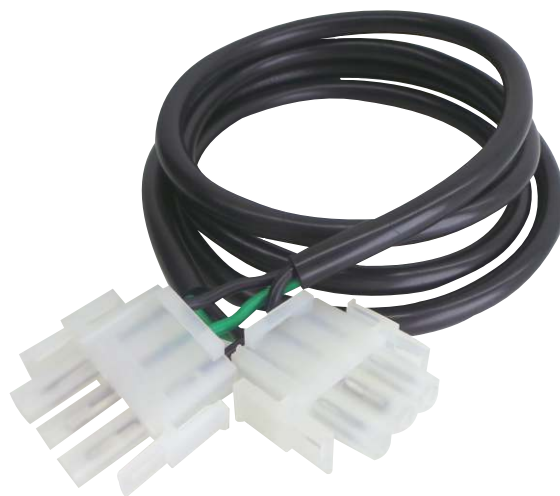
Conector Macho / Macho